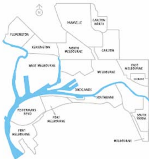
Figure 1 City of Melbourne

Melbourne incorporates the following suburbs: Carlton; Carlton North; Docklands; East Melbourne; Fishermans Bend; Flemington; Jolimont; Kensington; Melbourne; North Melbourne; Parkville; Port Melbourne; Southbank; South Yarra; and West Melbourne. The municipality is 36.5km 2 and shares its borders with seven other councils.