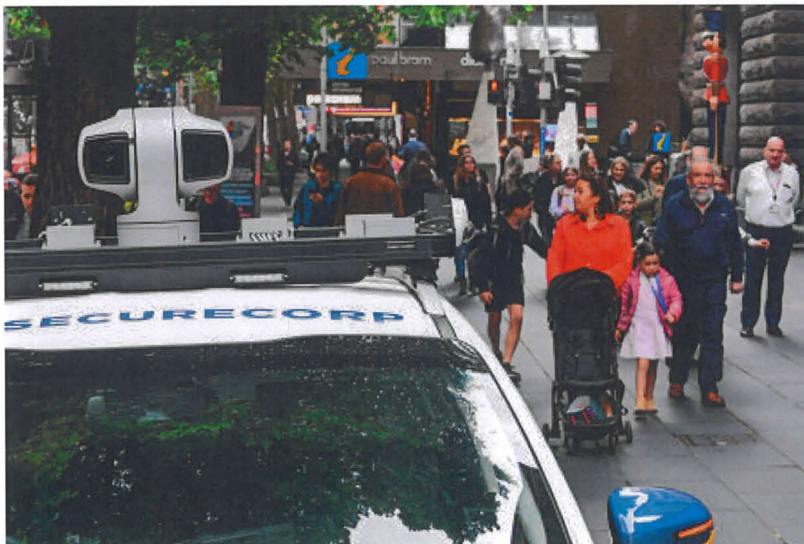
The Safe City camera car that puts electronic eyes down blind spots.

Just outside is a high-profile council-controlled private security vehicle — equipped with five fixed cameras and one 360-degree camera to patrol Melbourne lanes not covered by the cameras attached to buildings and poles.