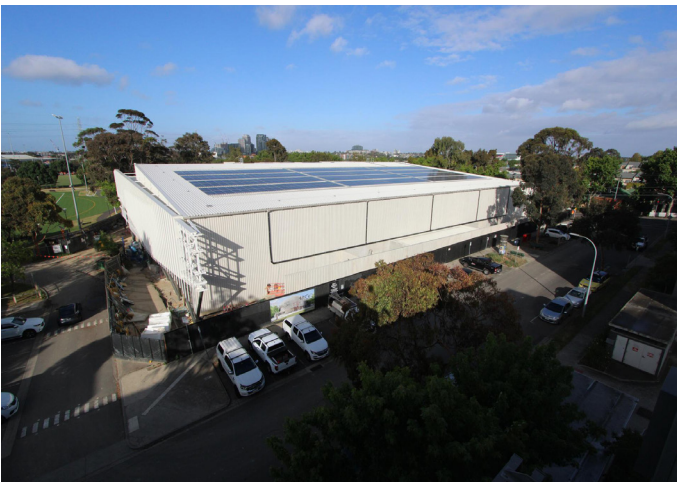
New solar panels on the roof