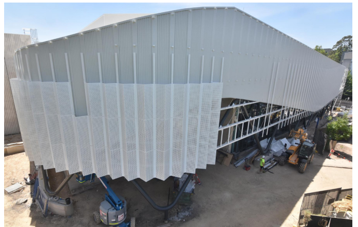
Main entrance façade

Applications close on Tuesday 10 December 2024 - to find out more, please scan the QR code below.