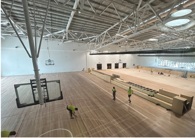
Line marking in the stadium