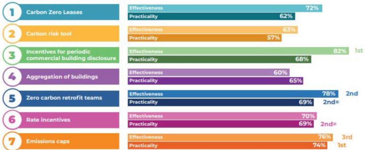
Figure 3. Responses on the effectiveness and practicality of previously proposed initiatives, City of Melbourne 2022

The introduction of MEPS, emissions limit or equivalent regulation provides a clear timeline for required action, a clear target metric, and potentially financial consequences for non-compliance and inaction. It has proven effective in accelerating retrofit rates in several cities in the United States, including New York (see Case Study below). In Australia, a single, federal MEPS regulation would provide a consistent standard for the property sector to follow. This approach is preferable to individual cities implementing different mechanisms to deliver the same outcome, which carries the risk of greater complexity and compliance costs for building owners managing building portfolios across multiple jurisdictions. Lastly, for a successful scheme, the Australian government would need to consider the local, state and federal decarbonisation and net zero targets.