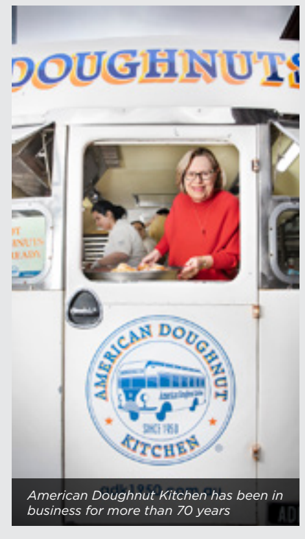
American Doughnut Kitchen has been in business for more than 70 years

Among this year’s list was American Doughnut Kitchen, which has been serving up hot jam doughnuts at Queen Victoria Market for more than 70 years. Stop by the vintage van on market days to support this three-generation family business.