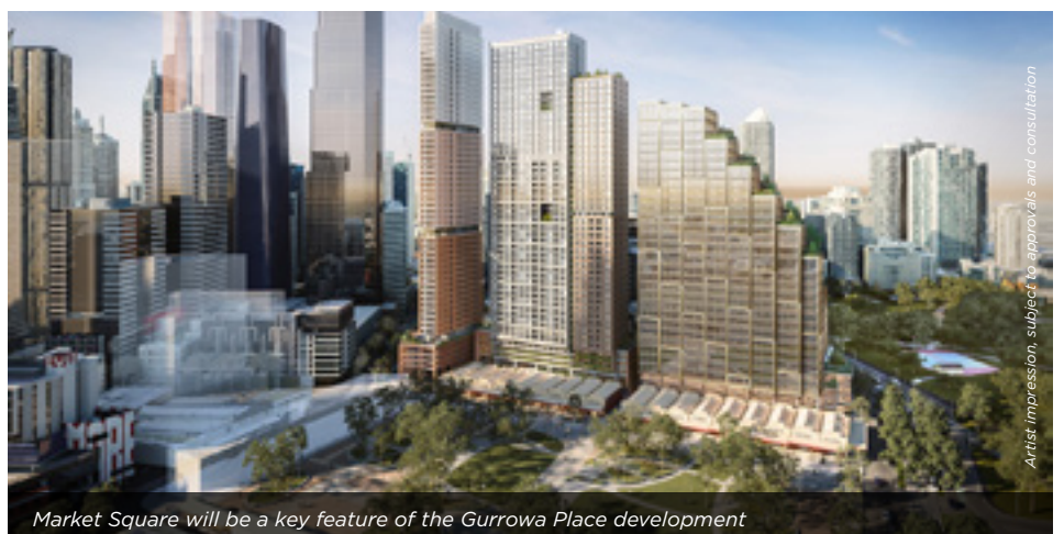
Market Square will be a key feature of the Gurrova Place development

The market is open 6am to 3pm Tuesday, Thursday and Friday, 6am to 4pm Saturday and 9am to 4pm Sunday. Specialty retail stores open at 9am.