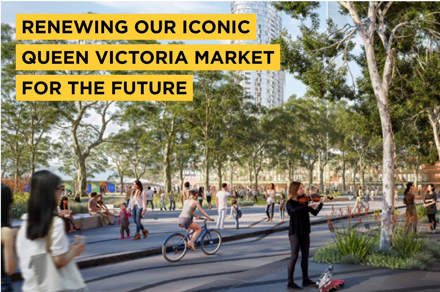
An artist's impression of the Gurrova Place project, the biggest mixed-use development in Council's history