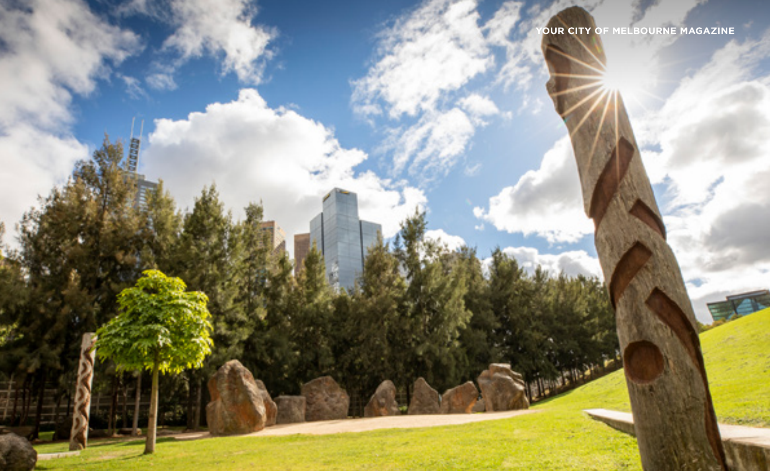
'Birrarrung Wilam' - meaning river camp - is an environmental art project at Birrarung Marr that celebrates the physical and spiritual connections between Traditional Owners and Country