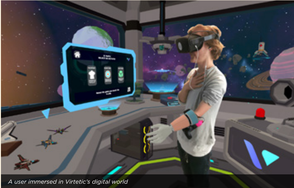
A user immersed in Virtetic's digital world