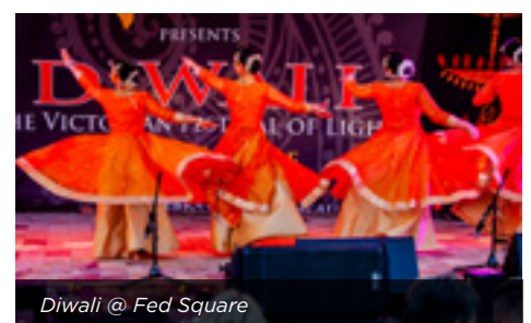
Diwali @ Fed Square

Experience Melbourne's rich and diverse Mexican culture through cuisine, folklore, celebrations, dance, music, bright costumes and mariachi. Find the fun at Golden Square Car Park on Lonsdale Street.