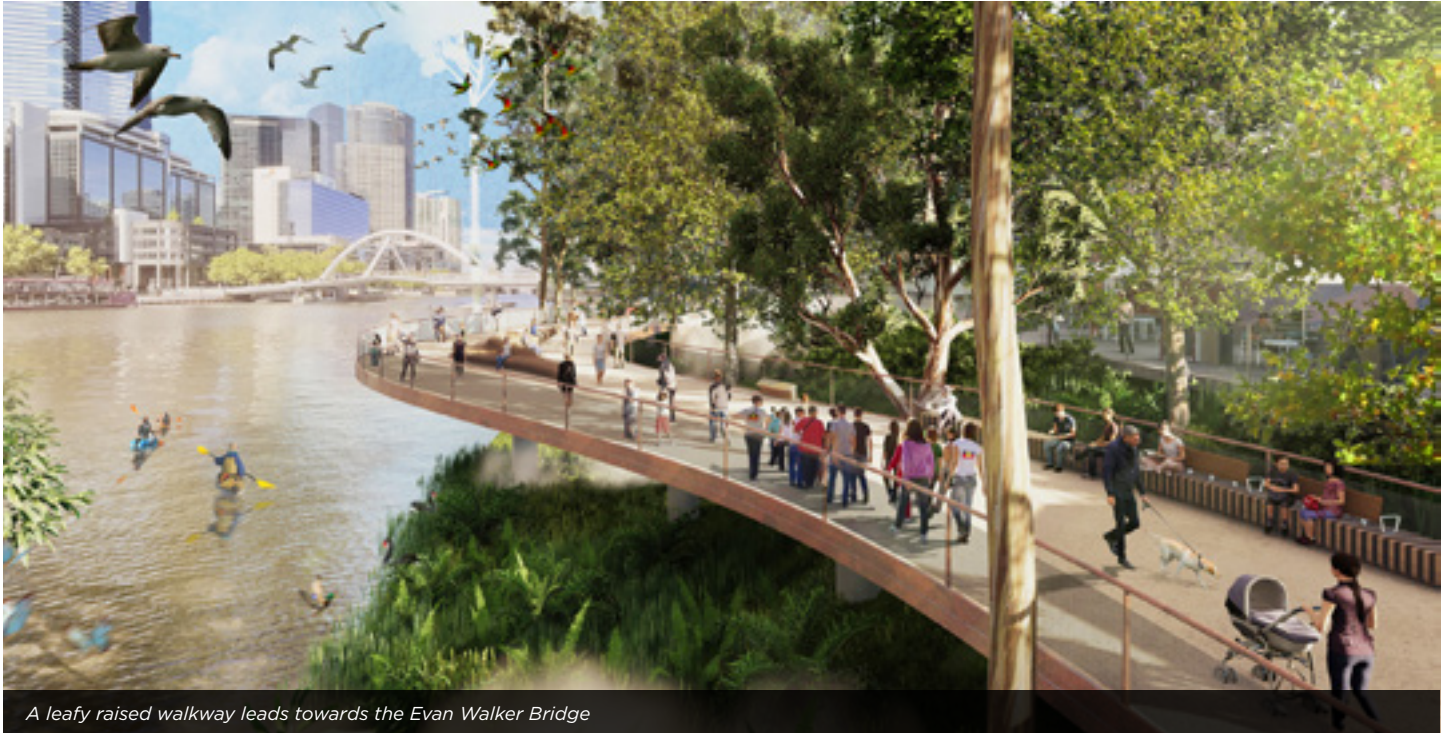
A leafy raised walkway leads towards the Evan Walker Bridge