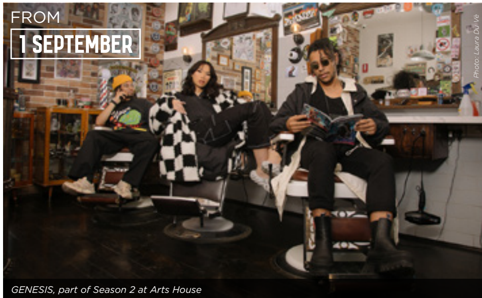
GENESIS, part of Season 2 at Arts House