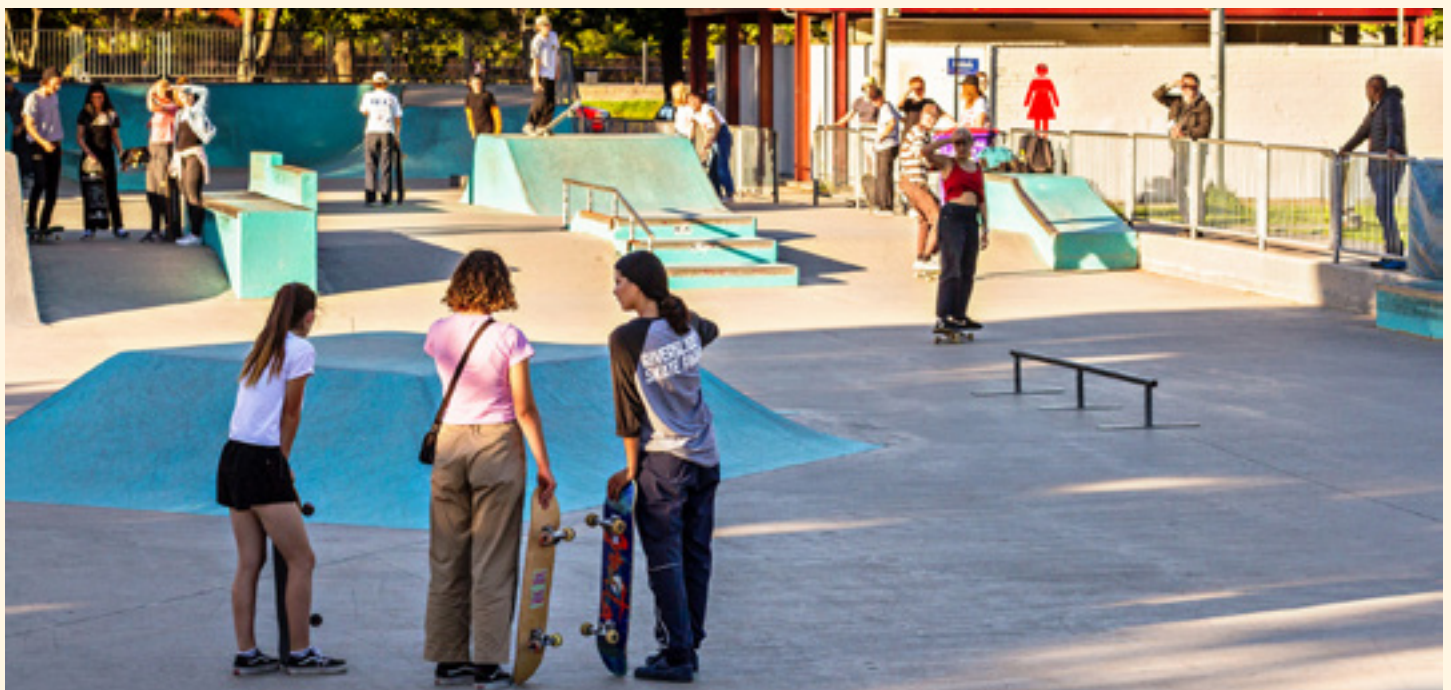
A sunny day at Riverslide Skate Park, on the banks of the Birrarung

FOR MORE INFORMATION, VISIT melbourne.vic.gov.au/skating