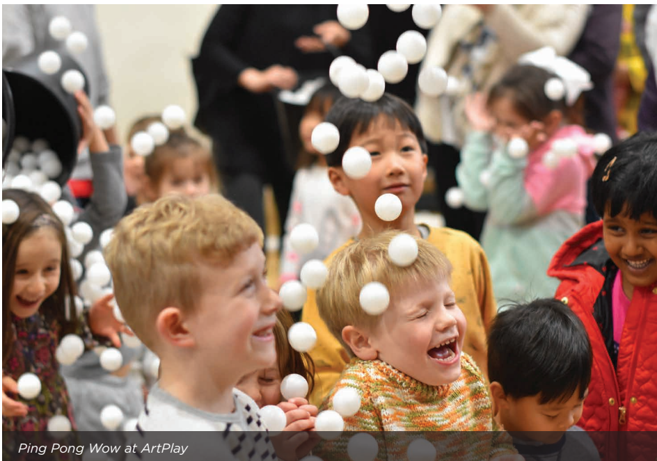
Ping Pong Wow at ArtPlay