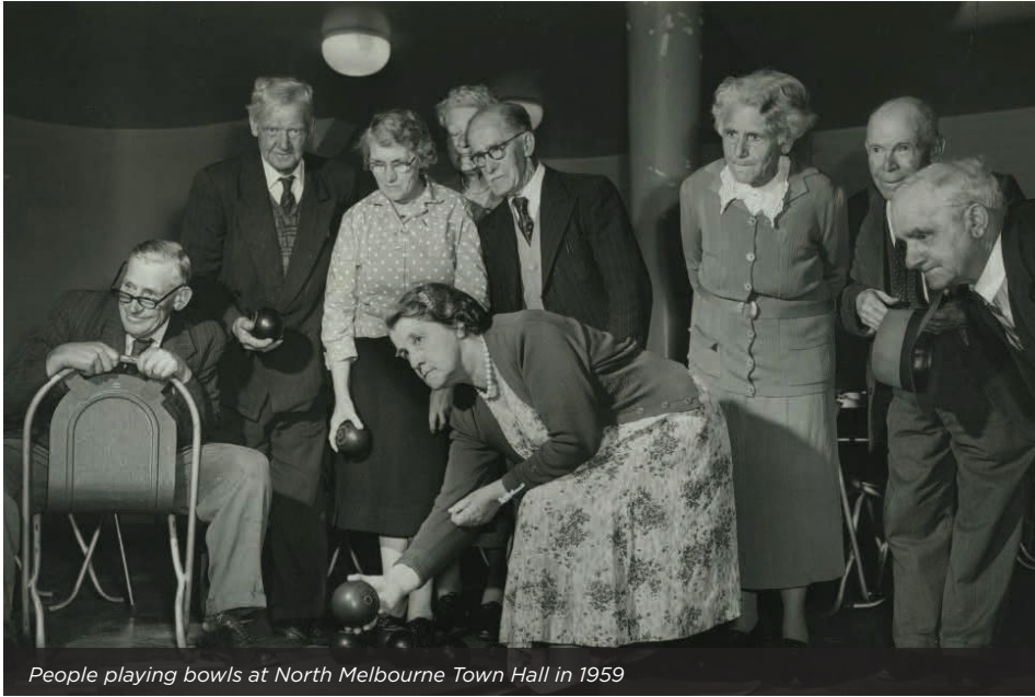
People playing bowls at North Melbourne Town Hall in 1959