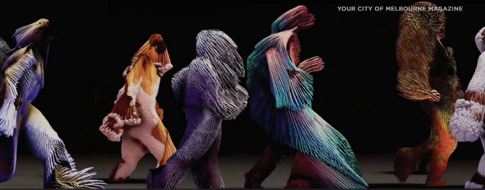
Infinity by Universal Everything