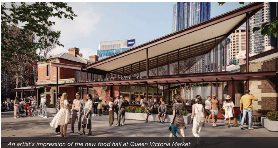
An artist's impression of the new food hall at Queen Victoria Market

Works in this state-of-the-art facility will ramp up this year, with doors set to open in early 2025. It will feature a 25-metre pool, improved gym facilities, a kids' water-play area, three full-sized multipurpose courts, health and wellness areas, flexible spaces for classes and community uses, accessible change rooms and a new cafe.