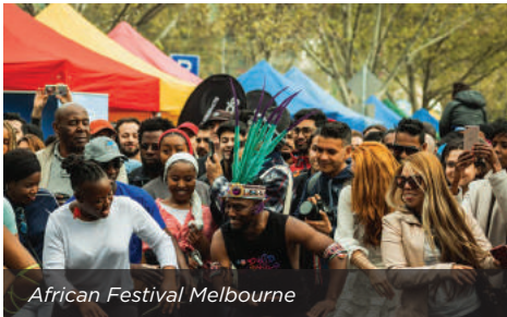
African Festival Melbourne

Immerse yourself in African culture with delicious food, lively entertainment and free family activities. Head to Queen Victoria Market to hum, sway and dance to the beat of the drum.