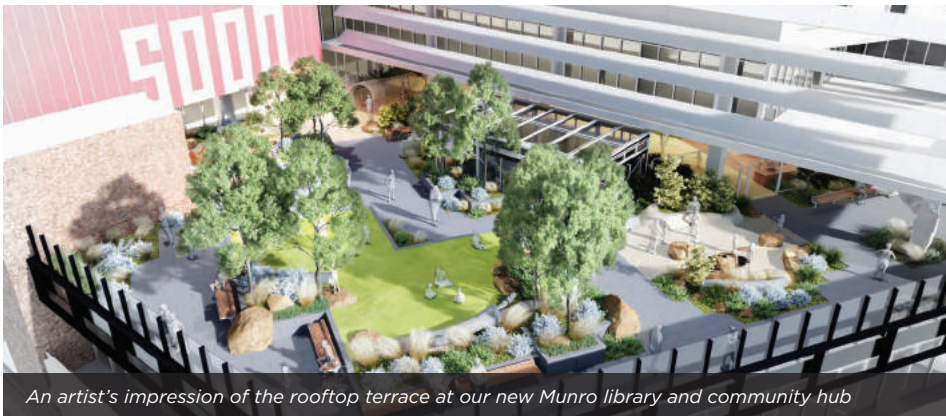
An artist's impression of the rooftop terrace at our new Munro library and community hub

We design and deliver a packed program of capital works to make your neighbourhood a great place to live, work and visit.