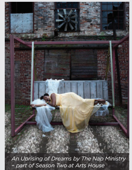
An Uprising of Dreams by The Nap Ministry - part of Season Two at Arts House

Discover an eclectic and electric program of music, theatre, dance and celebration at Melbourne's home of contemporary performance, located in North Melbourne. Learn more at artshouse.com.au