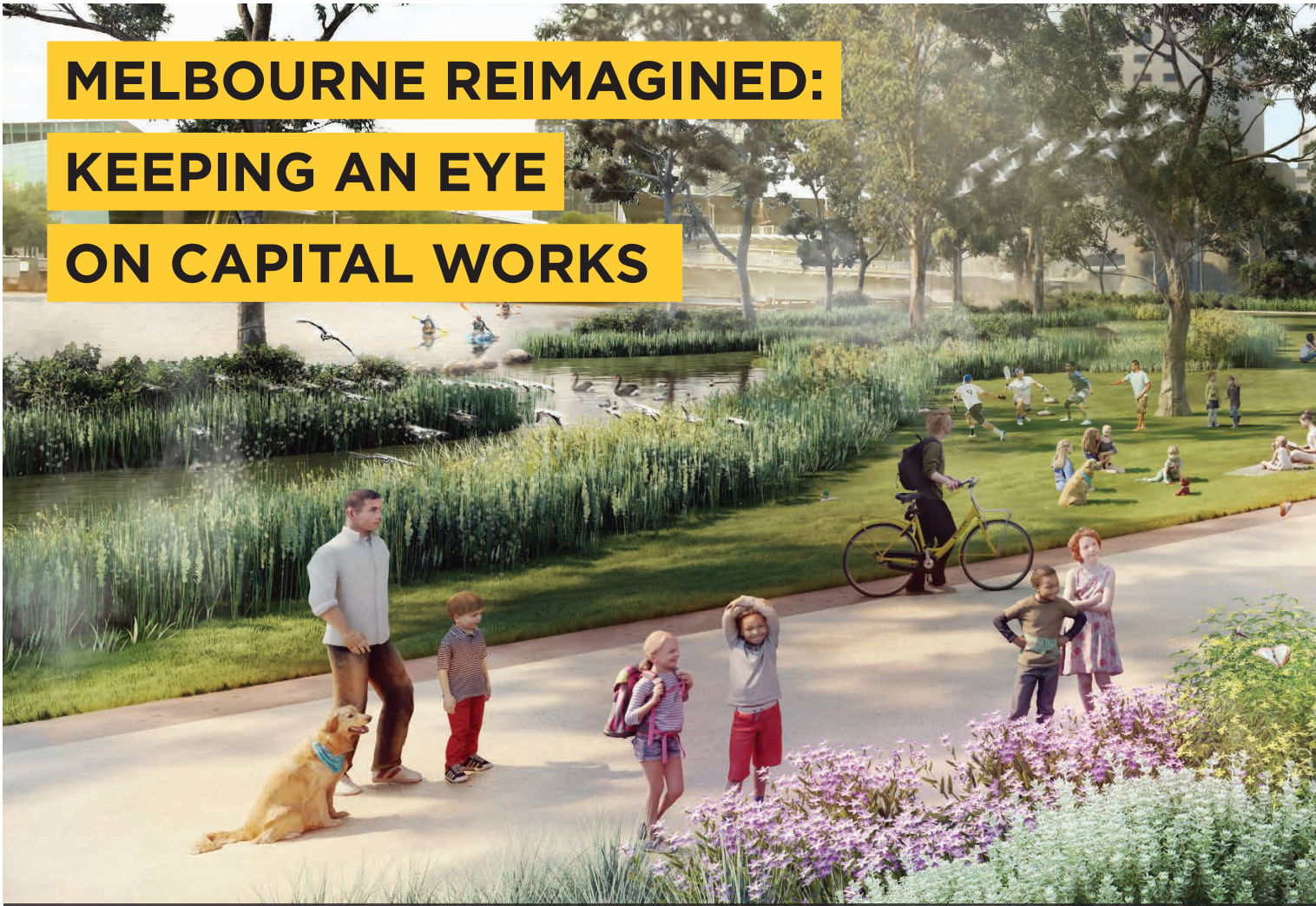
The Greenline project will revitalise the north bank of the Yarra River – Birrarung