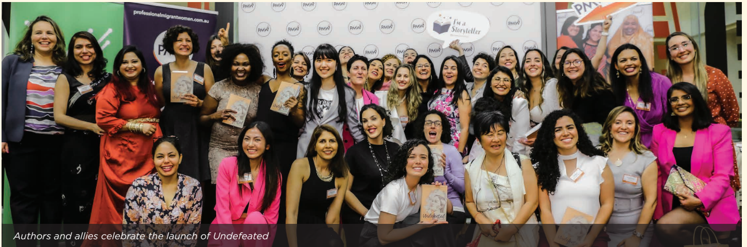
Authors and allies celebrate the launch of Undefeated