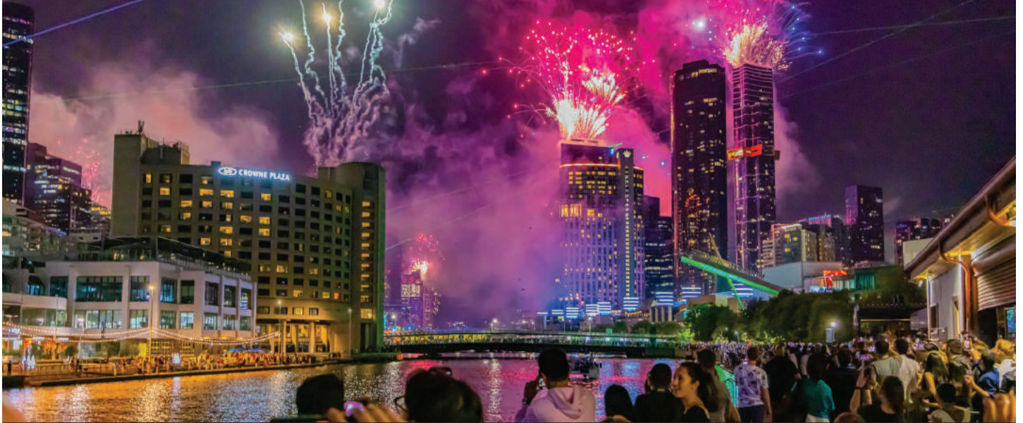
We've planned a full calendar of events so everyone can enjoy an affordable visit to the city

City-shaping infrastructure projects, our biggest events calendar and making the city safer and cleaner are highlights of the City of Melbourne's Budget 2023-24.