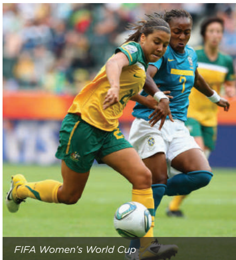
FIFA Women's World Cup