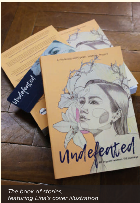
The book of stories, featuring Lina's cover illustration