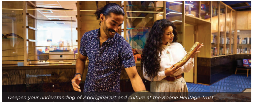
Deepen your understanding of Aboriginal art and culture at the Koorie Heritage Trust

View the menu and opening hours at pawacatering.com.au/cafe-bar