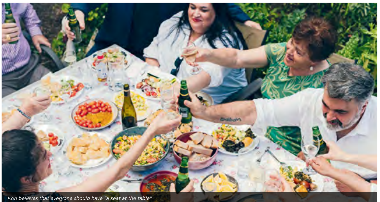
Kon believes that everyone should have “a seat at the table”