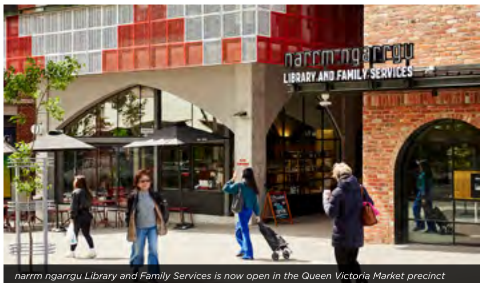
narm ngarrgu Library and Family Services is now open in the Queen Victoria Market precinct

Bluestone restoration and conservation works are now underway on the Princes Bridge. This project ensures the iconic landmark can continue to support residents, workers and visitors into the future.