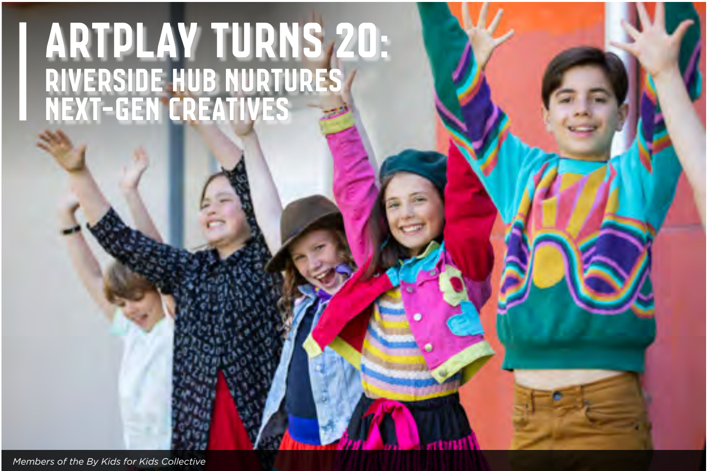
Members of the By Kids for Kids Collective