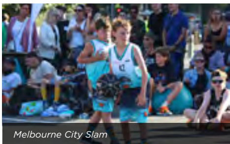
Melbourne City Slam

Head to Queensbridge Square for a four-day festival of basketball for players of all skill levels. Events will include games between community groups, free play for people walking past, a slam dunk competition and a skills competition featuring basketball legends and giveaways.