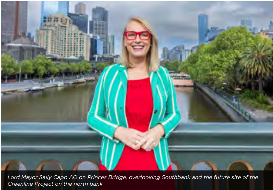
Lord Mayor Sally Capp AO on Princes Bridge, overlooking Southbank and the future site of the Greenline Project on the north bank