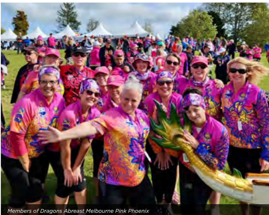
Members of Dragons Abreast Melbourne Pink Phoenix

Dragons Abreast Melbourne Pink Phoenix paddle for one hour from 10am on Saturdays and, during the non-winter months, from 6pm on Wednesdays. No prior experience is necessary. Meet at the Community Hub @ The Dock, 912 Collins Street, Docklands.