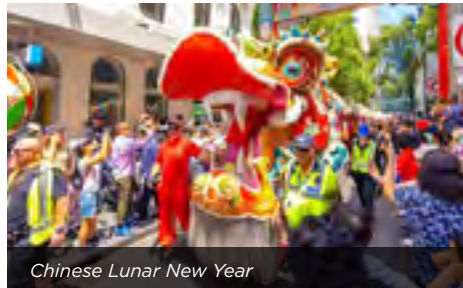
Chinese Lunar New Year

Celebrate the valuable roles that libraries play in our lives with a visit to your local branch, the new narm ngarrgu library in the Queen Victoria Market precinct, a pop-up library or our roving Mel-Van. And books are just the beginning. Our libraries also offer movies, music, games, 3D printers, sewing machines, recording studios and much more. Start exploring at melbourne.vic.gov.au/libraries